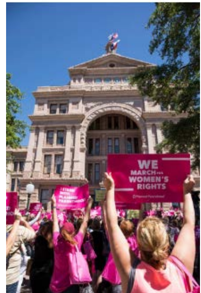
Planned Parenthood supporters rally outside the Texas Capitol.

In response, PPFA has provided technical support to Planned Parenthood organizations at the state level working to educate the public on the critical importance of access to abortion as well as the full range of services Planned Parenthood provides. During this period we helped build levels of public support for Planned Parenthood that contributed to protecting women's health in a number of states. This included halting abortion restrictions and a Planned Parenthood "defunding" measure in Mississippi; abortion restrictions in Georgia; a measure banning abortion at 20 weeks and medication abortion via telemedicine in Utah; and a junk science abortion reversal bill in Idaho.