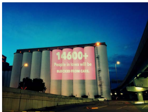
Grain silos in Iowa carried a message on the vital role of Planned Parenthood during Pink Out the Night in June 2017.

Without an ally in the White House or a pro-women's health majority in either chamber of Congress, we are facing an onslaught of attempts to roll back access to reproductive health care at home and abroad, including access to the trusted care Planned Parenthood health centers provide. In response, PPFA relaunched our "I Stand with Planned Parenthood" campaign in January 2017.